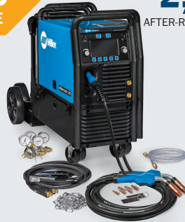
MIG Welder 951766