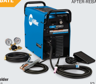
TIG Welder 907627