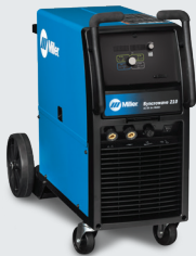
TIG/Stick Welder 907596 (without spool gun)