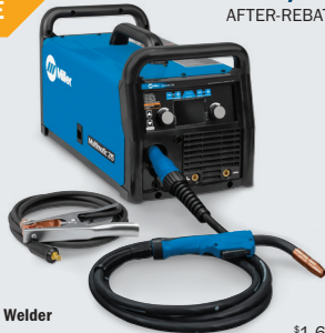
Multiprocess Welder 907693